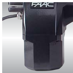
■ Electric motor complete with thermal protection