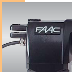
■ Emergency release

The FAAC 412 electro-mechanical device cuts down considerably on maintenance. Reliability is assured under all atmospheric conditions and in an outdoor temperature range of -20°C to +55°C.