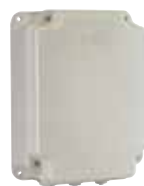
Enclosure mod. E compatible with control boards 200 MPS