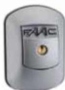
XK 21 H 230 V *** - Burglar-resistant key-selector with lever release (only for R 180 - R 280)