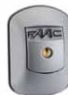
XK 21 L 24 V *** - Burglar-resistant key-selector with lever release (only with control board 200 BT and 200 MPS)