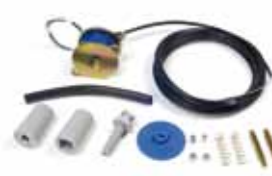
EF - 27 ** Electric brake for Series 227