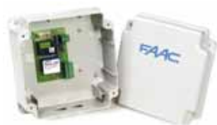
Control unit with "dead man" logic mod. 200 BT Technical specifications page 158