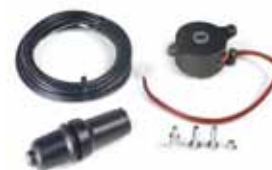
Electric brake R 180 - R 280 *