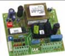
Control board mod. 200 MPS Technical specifications page 159